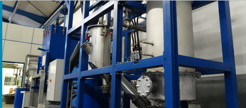
1 Gasifier test rig